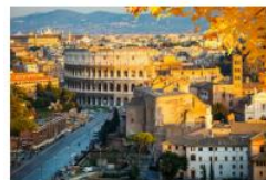
Colosseum in Rome