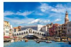
Rialto Bridge in Venice