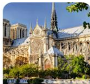
Cathédrale Notre-Dame de Paris