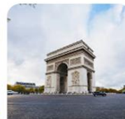
Arc de Triomphe